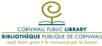
Cornwall Public Library