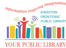
Kingston Frontenac Public Library